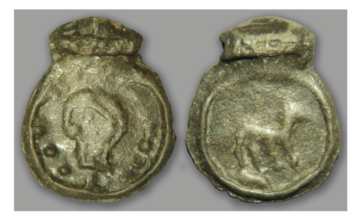
Fig. 13. Cat. no. 9. From Khlong Thom (southern Thailand). Suthiratana Foundation, no number.

Septimius Severus with a date-range limited to the years 198–202 C.E. might have been issued. It is here of special numismatic interest that, by way of this imitation, indirectly an otherwise unknown reverse of Septimius Severus has been regained. In a jewellery ornament, which we assume the Thaksin imitation to be, the hybrid combination of obverse and reverse copied from coins of different emperors would be no matter of any consequence.