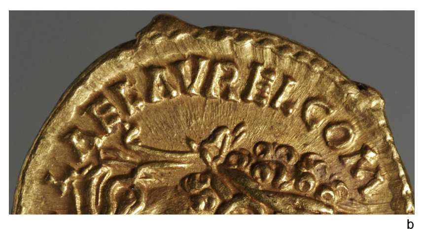
Fig. 6. a Detail of Cat. no. 2 from Óc Eo; b Detail of Aureus of Commodus shown in fig. 5.