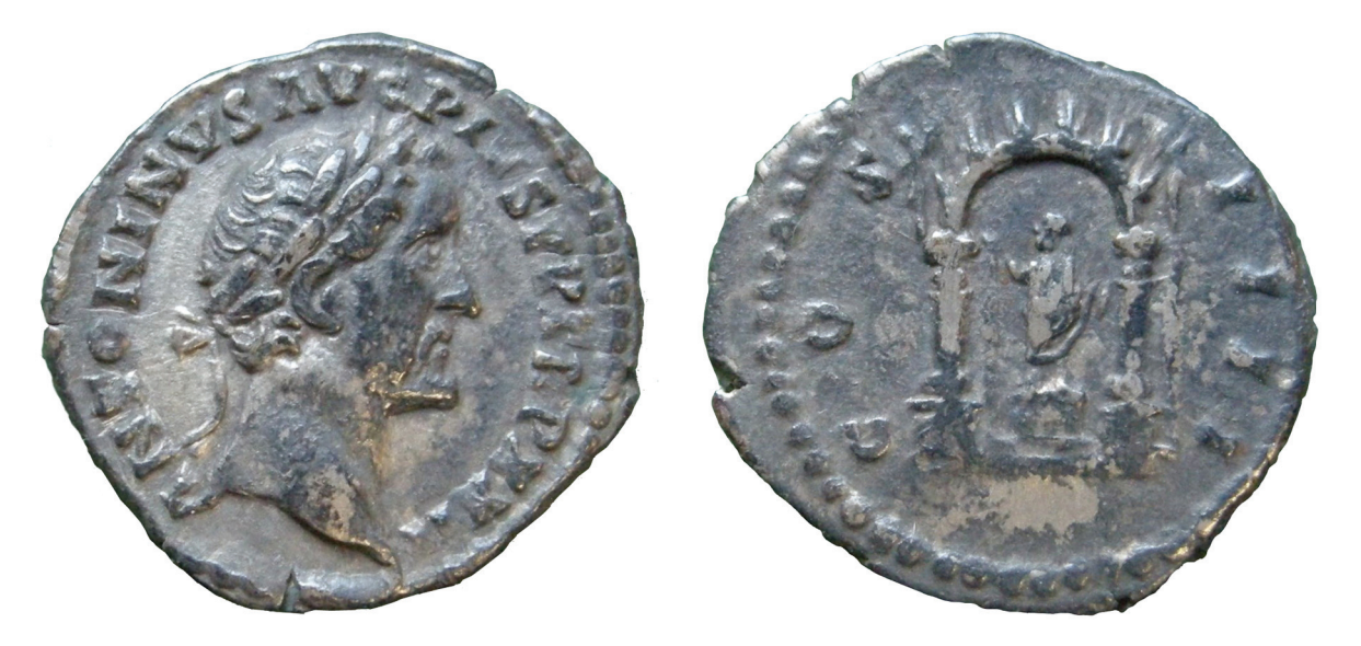
Fig. 8. Glasgow, The Hunterian Museum and Art Gallery no. 112. Denarius of Antoninus Pius, 158-159 C.E.

the coins of Antoninus Pius for a possible prototype. The major part of the legend can be clearly read. It begins on the left with ANTONINVS, and, leaving an empty space above the head, continues on the right with IVS PP followed by a group of unclear letters. Although the break in the legend above the emperor's head is a feature frequently found on Antoninus Pius' coins, here, most strikingly, an essential part of the regular legend is missing; the letters AVG for the title Augustus and the P of Pius. This could be explained if the prototype had a continuous legend with these four letters placed above the head, where, on the imitation from Khlong Thom, the blank space appears. Such a layout is found on silver coins of Antoninus Pius issued in the years 158-160 C.E.<sup>23</sup>. They have a continuous legend, ANTONINVS AVG PIVS P P TR P XXII, respectively TR P XXIII, from left to right, so that the AVG and the P of PIVS appear just above the head, as seen here on a coin of the year 158-159 C.E. in the Hunter Coin Cabinet in Glasgow (fig. 8). In a closely similar manner, the legend on the Khlong Thom piece begins with the A of Antoninus on the left at the back of the neck, the S of Antoninus