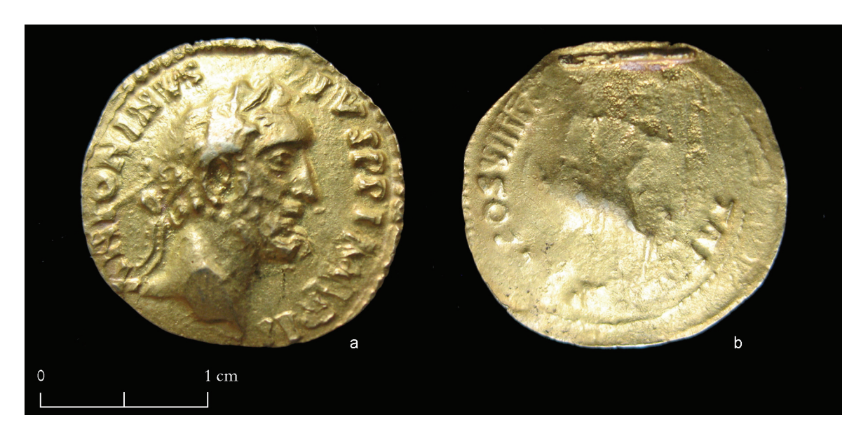
Fig. 7. Cat. no. 5. From Khlong Thom (southern Thailand). Suthiratana Foundation, inv. KLP 071.

the gold disc from Óc Eo (Fig. 6a)<sup>21</sup>. Likewise, on these coins of the year 192 C.E., details of the bearded head of Commodus with laurel wreath to the right, the bust cuirassed and draped, appear closely comparable to the Óc Eo piece. Such details are, for instance, the two ends of the ribbon behind the neck parting in two directions, the sharp ridges of the paludamentum folds around the neck, and its drapery folds on the chest forming an acute V-shaped angle. Even the general layout and, in particular, the space between the back of the head and the legend seem to correspond (figs. 4a, 5a, 6a,b).