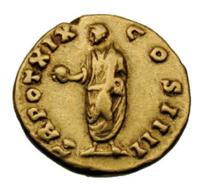
Fig. 12. Ex Museum of Fine Arts, Boston. Aureus of Antoninus Pius, 156 C.E.

argues that, in style as well as in details of the legend, the Thaksin piece is closely related to the coinage of Septimius Severus minted in the years 198–202 C.E. These coins refer to his victory in the Middle East and were minted after the fall of Ctesiphon, the capital of the