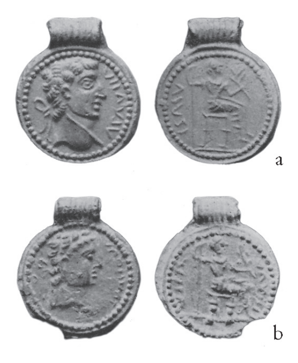
Fig. 15. Clay pendants from Kondapur, Andhra Pradesh (southern India). Scale aprox. 1:1 (from Wheeler 1954: Plates 28 and 29).

state Andhra Pradesh in south-eastern India. Some of them are rather faithful copies with a legible legend, the majority are more distant imitations, some still with a pseudo-legend, others without any legend at all. The better imitations were made of metal, sometimes lead covered with gold foil, the others are usually made of clay (fig. 15) and are clearly of local Indian manufacture, which is also assumed for the metal imitations. Usually, these Indian imitations, even those made of clay, have the double piercing commonly encountered on Indian coin pendants, but many of the clay pendants were moulded together with their suspension loops of a ribbed tubular shape like that of the Khlong Thom pendant<sup>43</sup>. The pendant from Khlong Thom is certainly to be seen in the context of the popularity of the Indian pendants imitating this particular coin of Tiberius. Such pendants might have