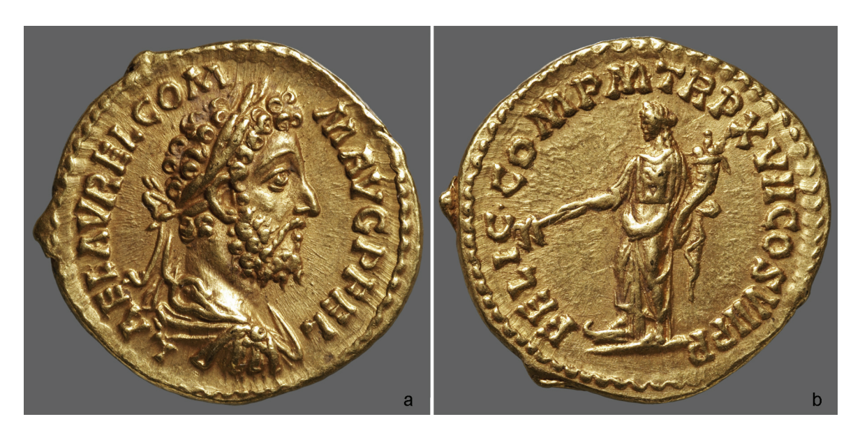
Fig. 5. Vienna, Kunsthistorisches Museum inv. 35.207. Aureus of Commodus, 192 C.E.