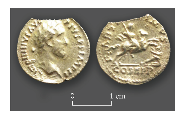
Fig. 11. Cat. no. 6. From Khlong Thom (southern Thailand). Thaksin Folklore Museum of the Institute for Southern Thai Studies inv. 43110423, Thaksin University, Koh Yo, Songkhla Province.

here on an example formerly in the Museum of Fine Arts, Boston (fig. 12)<sup>30</sup>. Besides the general layout of head and legend in the field, it is also the shape of the letters, the contour of the profile, the wavy contour of the bust, and the split arrangement of the ribbon ends: one end flying behind, towards the letter O, the other end overlapping the neck. All these details correspond so closely that, in all likelihood, the mould for the imitation from Khlong Thom was derived from a coin struck in the same obverse die.