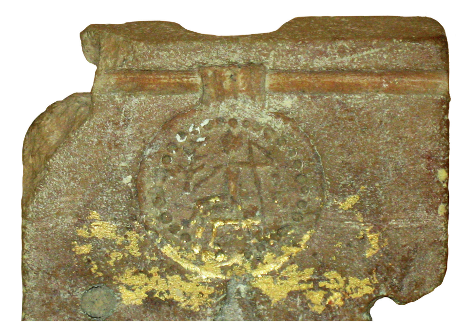
Fig. 16. Cat. no. 10. Stone mould from Khlong Thom (southern Thailand), Wat Khlong Thom Museum.