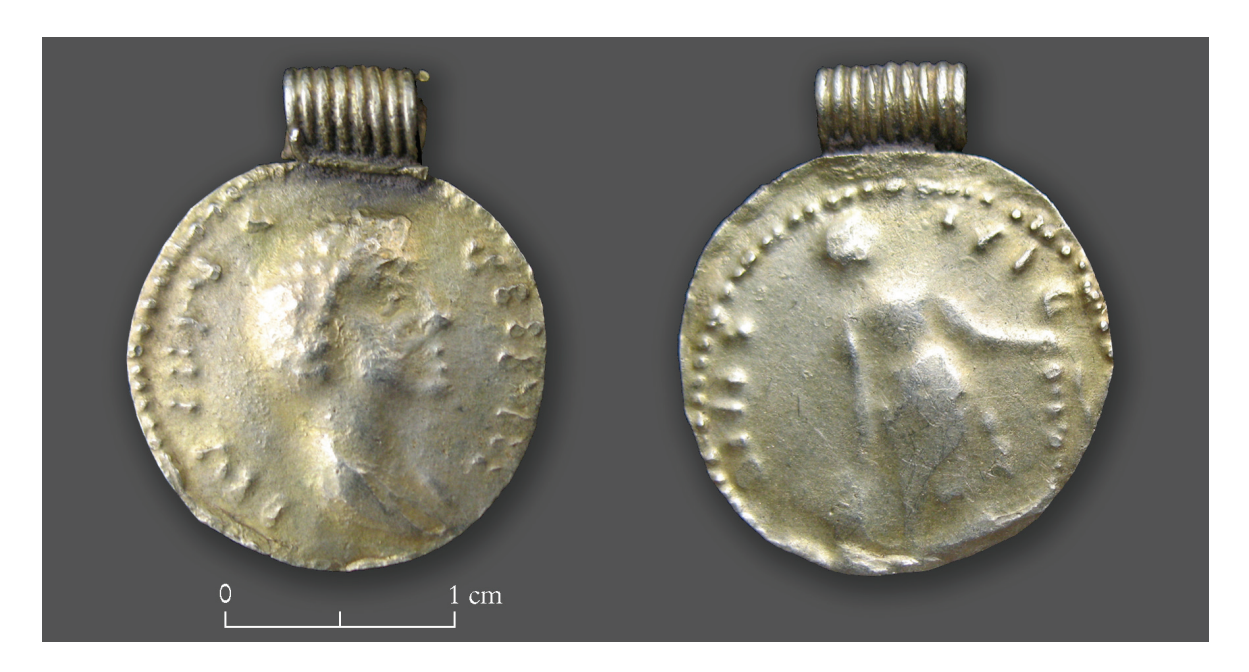
Fig. 9. Cat. no. 7. From Khlong Thom (southern Thailand). Suthiratana Foundation, no number.