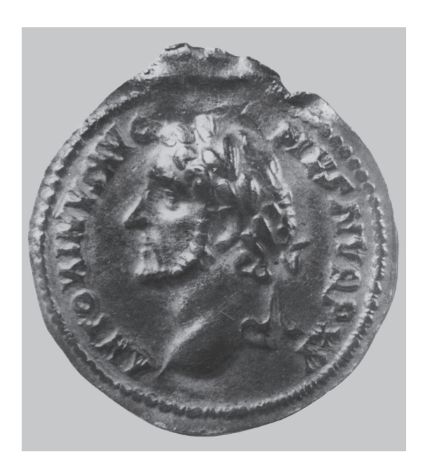
Fig. 1. Cat. no. 1. From Óc Eo (southern Vietnam).

from the coin, and then casting the bronze die in the lost-wax process. At the top, the gold sheet forms an extension which is partly broken off, but probably served to suspend it for use as a pendant.