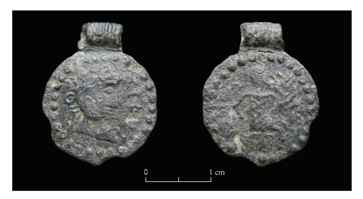
Fig. 14. Cat. no. 8. From Khlong Thom (southern Thailand). Suthiratana Foundation, no number.

refuse of tin working found at the site. One side of the pendant shows a head in profile to the left, crudely sketched in raised outline surrounded by a rudimentary beaded circle, a distant recollection of a coin design. The back depicts an indistinct quadruped to the right on a short groundline.