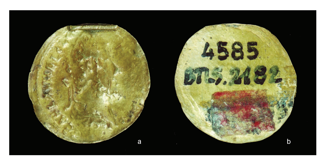
Fig. 4. Cat. no. 2. From Óc Eo (southern Vietnam). Museum of Vietnamese History, Ho Chi Minh City, inv. 2182.

account for the plain reverse<sup>16</sup>. However, as already Malleret assumed, it seems more likely that it was cast, as this would better explain the soft and soapy character of the modelling, in particular at the transition between ground and raised relief.