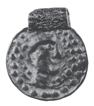
Fig. 3. Cat. no. 3. From Óc Eo (southern Vietnam).

Such use as a pendant finds further confirmation in another disc of thicker gold sheet from Óc Eo which is preserved complete with its attached suspension loop (cat. no. 3, fig. 3)<sup>15</sup>. It has a slightly larger diameter, and has a repoussé decoration vaguely reminiscent of the obverse design of a Roman coin. A coarsely-rendered head to the right is surrounded by a circle of embossed dots recalling the beaded circle of a Roman coin. More dots appear in the field behind the head and in front of it – perhaps meant as substitutes for the letters of a coin legend.