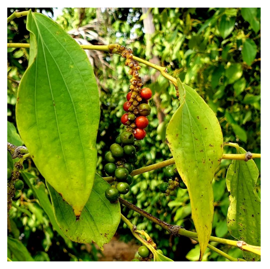
Kampot pepper