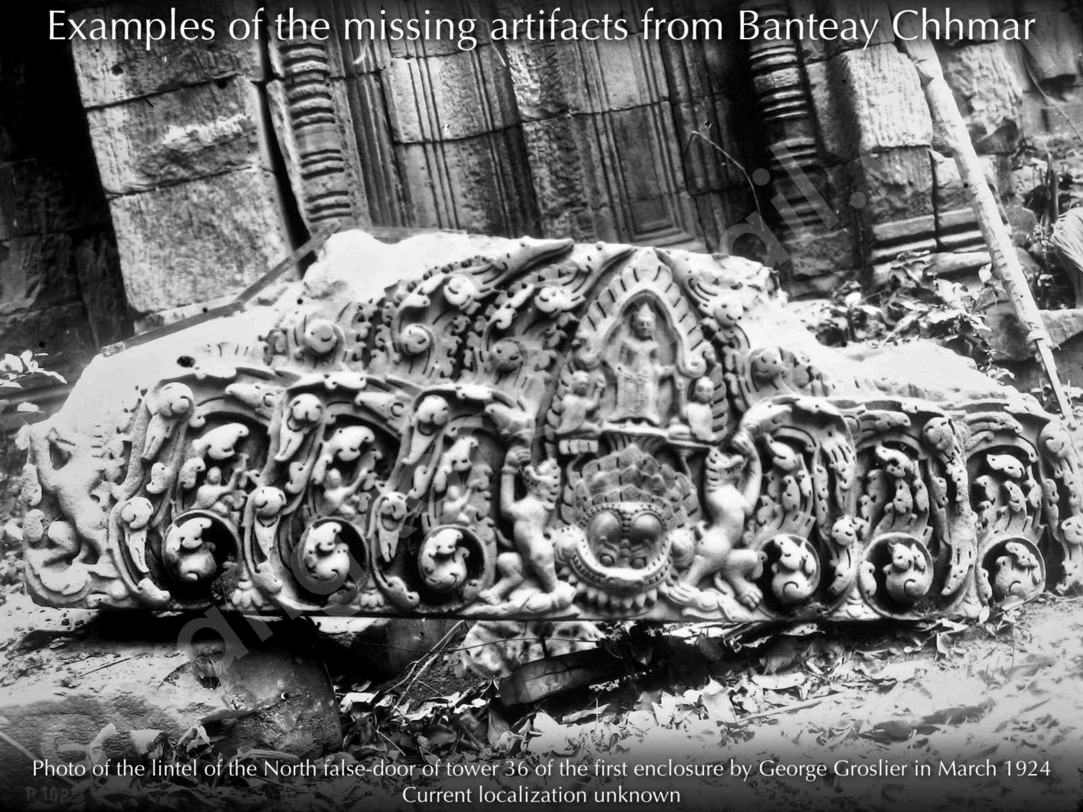
Photo of the lintel of the North false-door of tower 36 of the first enclosure in March 1924