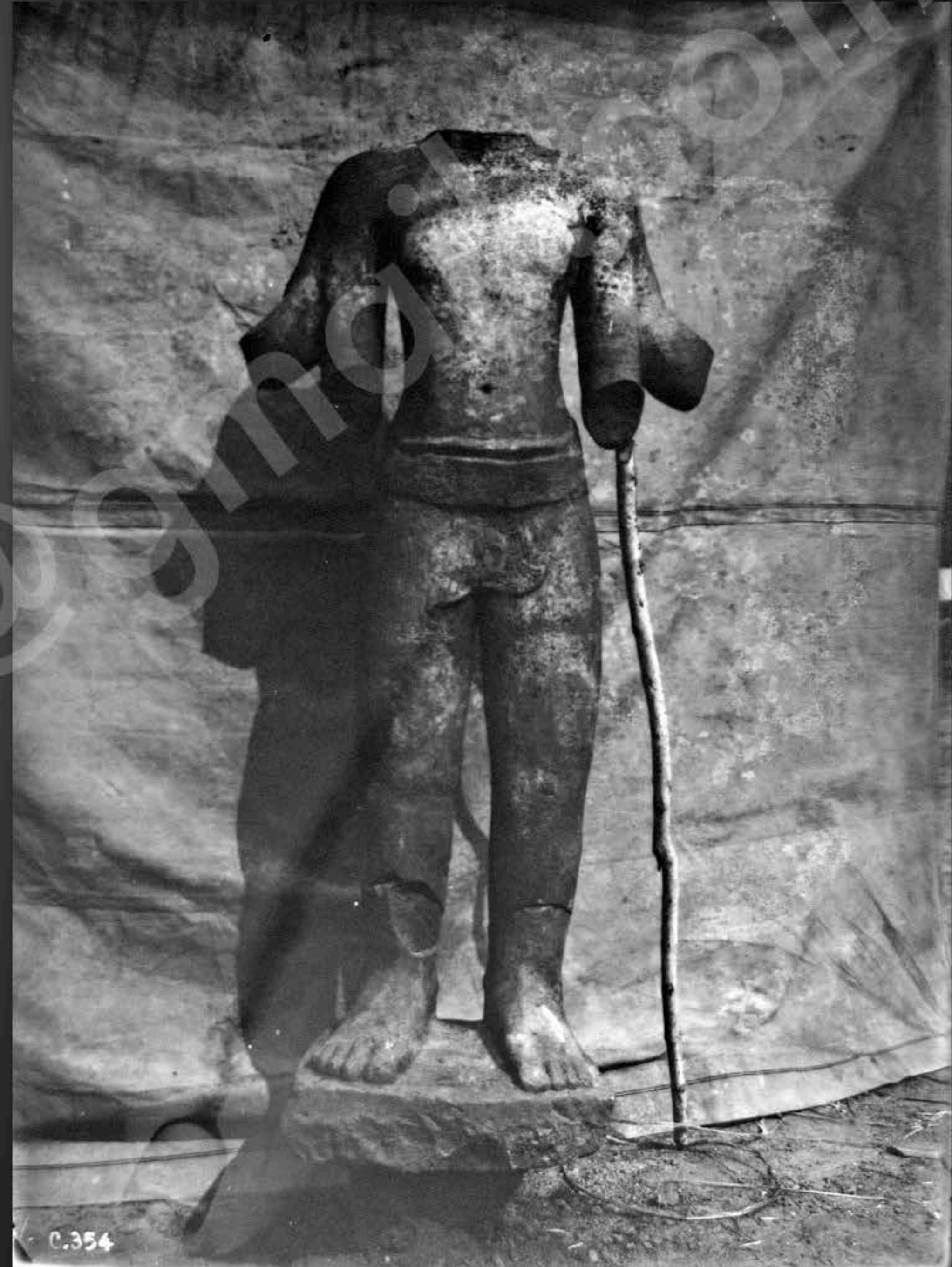
Photo male bodie with four arms by George Groslier in February 1935 Current localization unknown