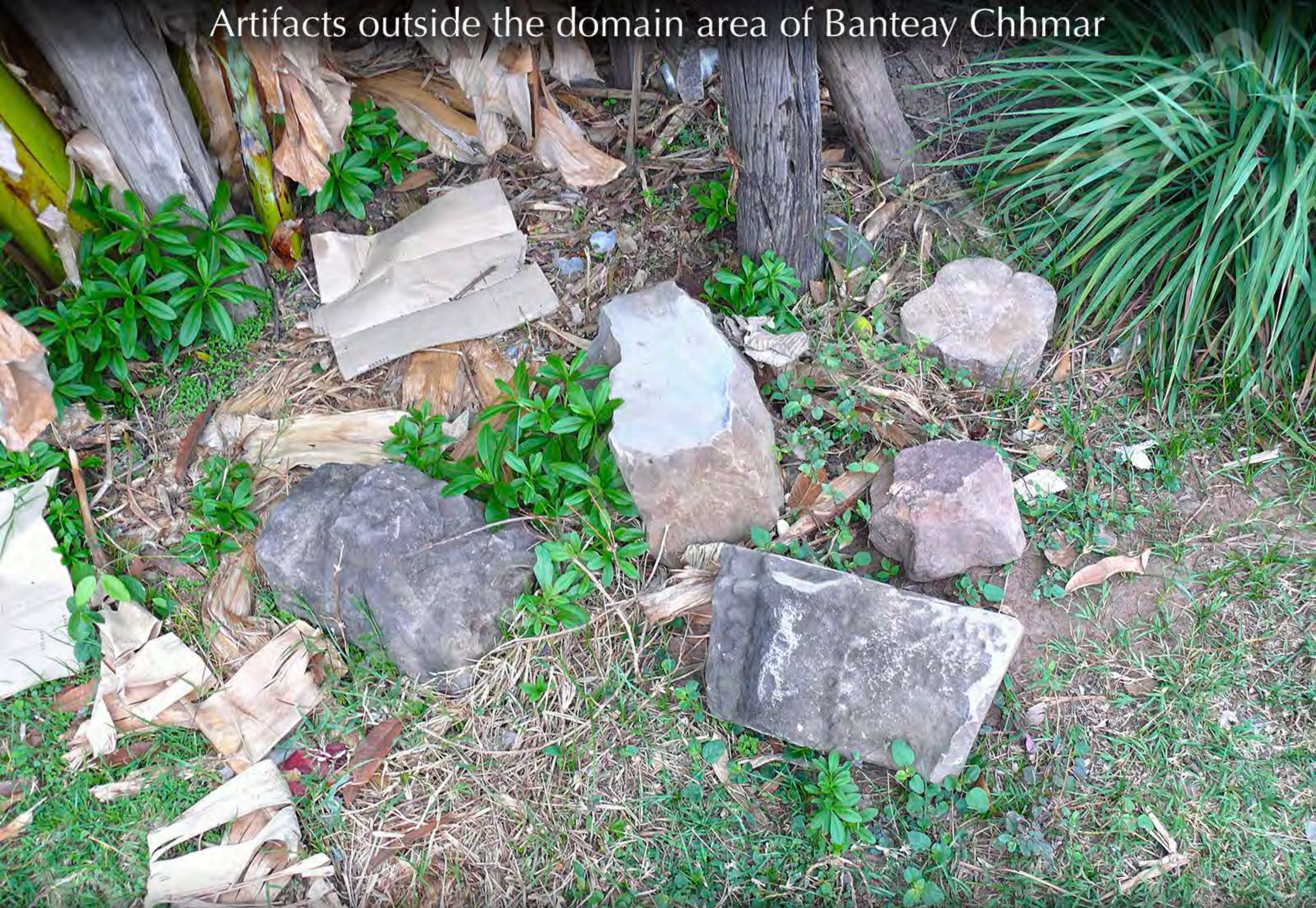
Examples of blocs of a standing lion probably from the base of the South "library" (building 81) located to the Southern village of Banteay Chhmar (2014)