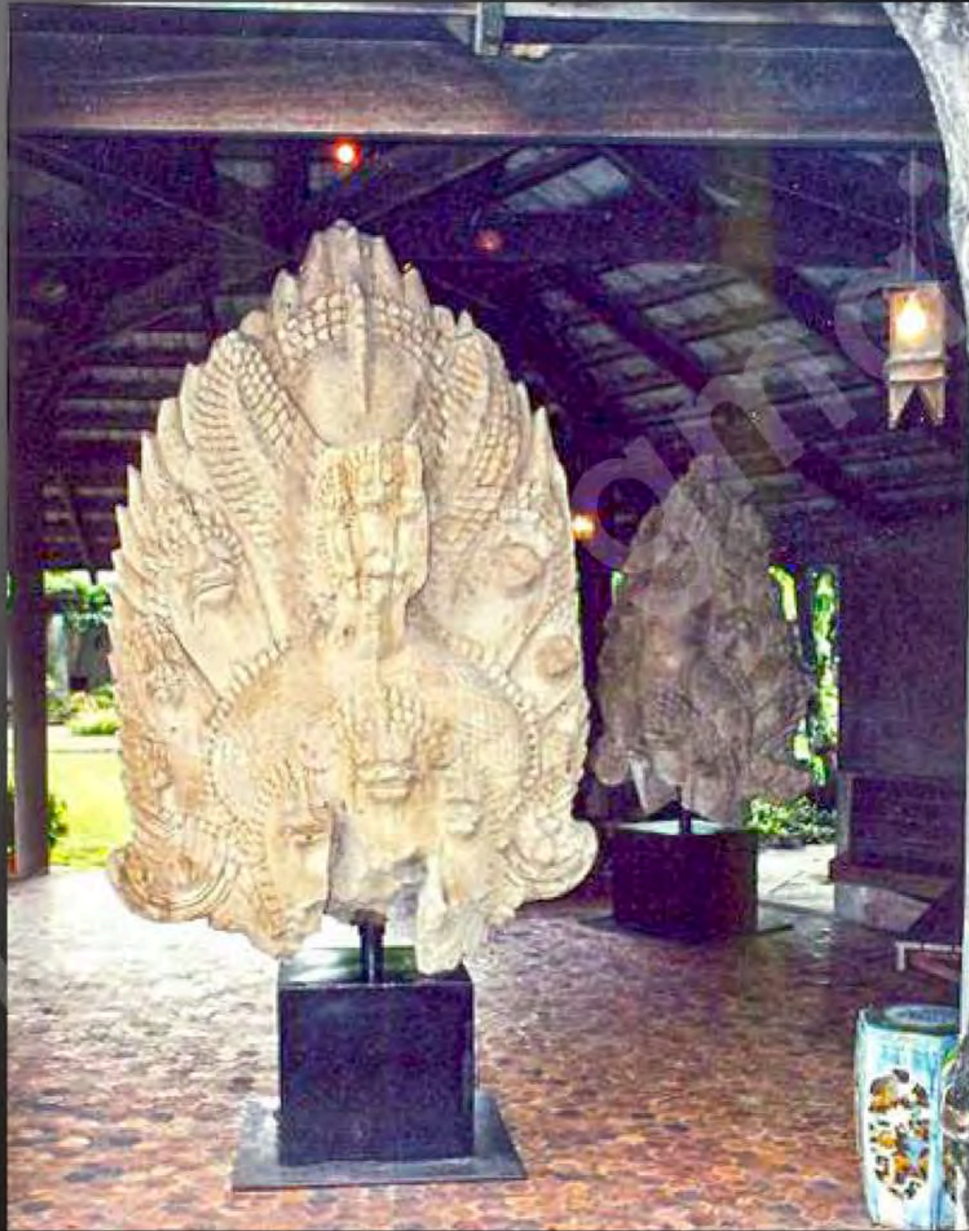
Ends of Naga-balustrades probably from Banteay Chhmar into private garden in Bangkok