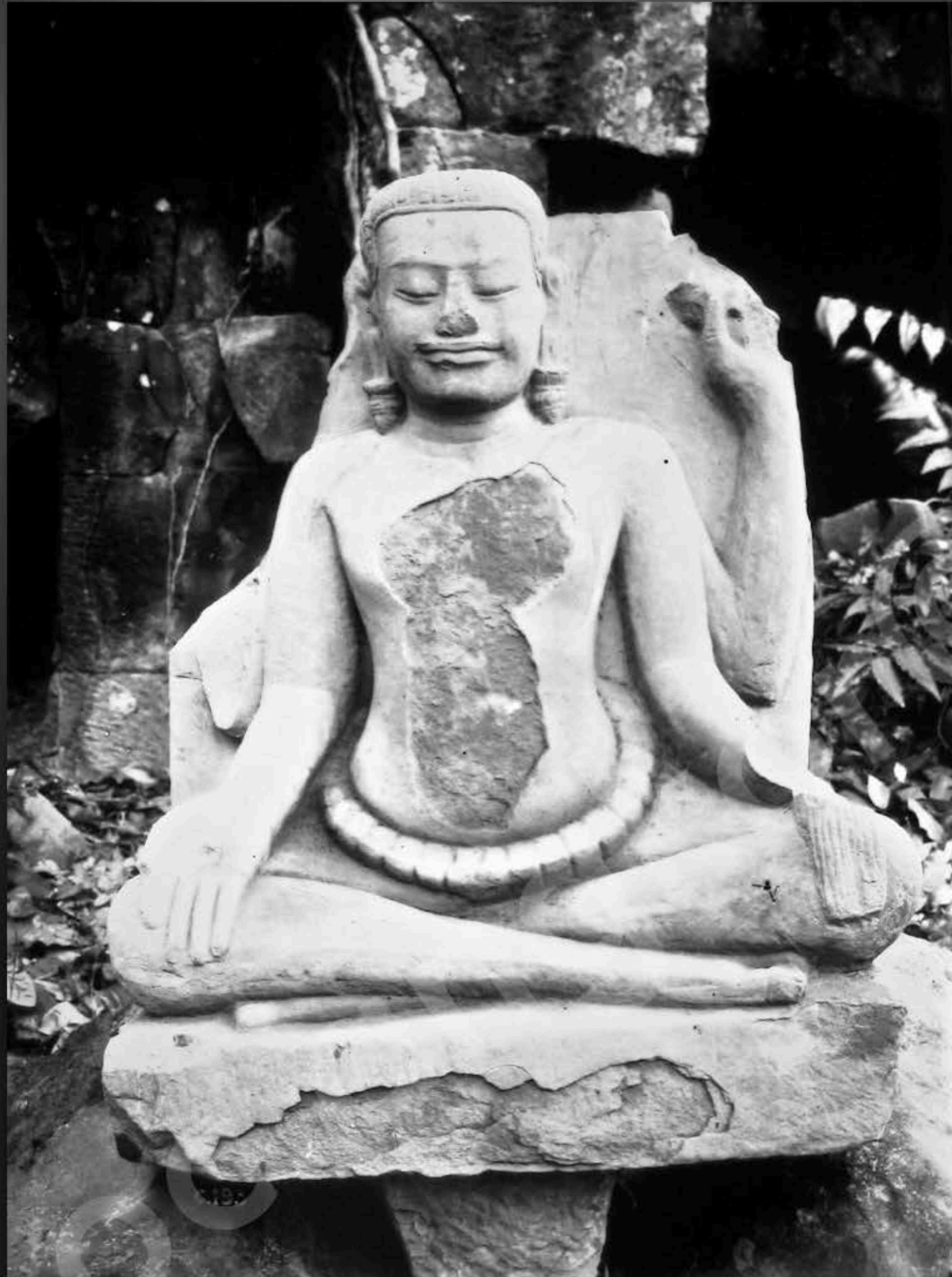
Photo of a seating Lokeshvara found in the "house od fire" by George Groslier in March 1924 - Current localization unknown