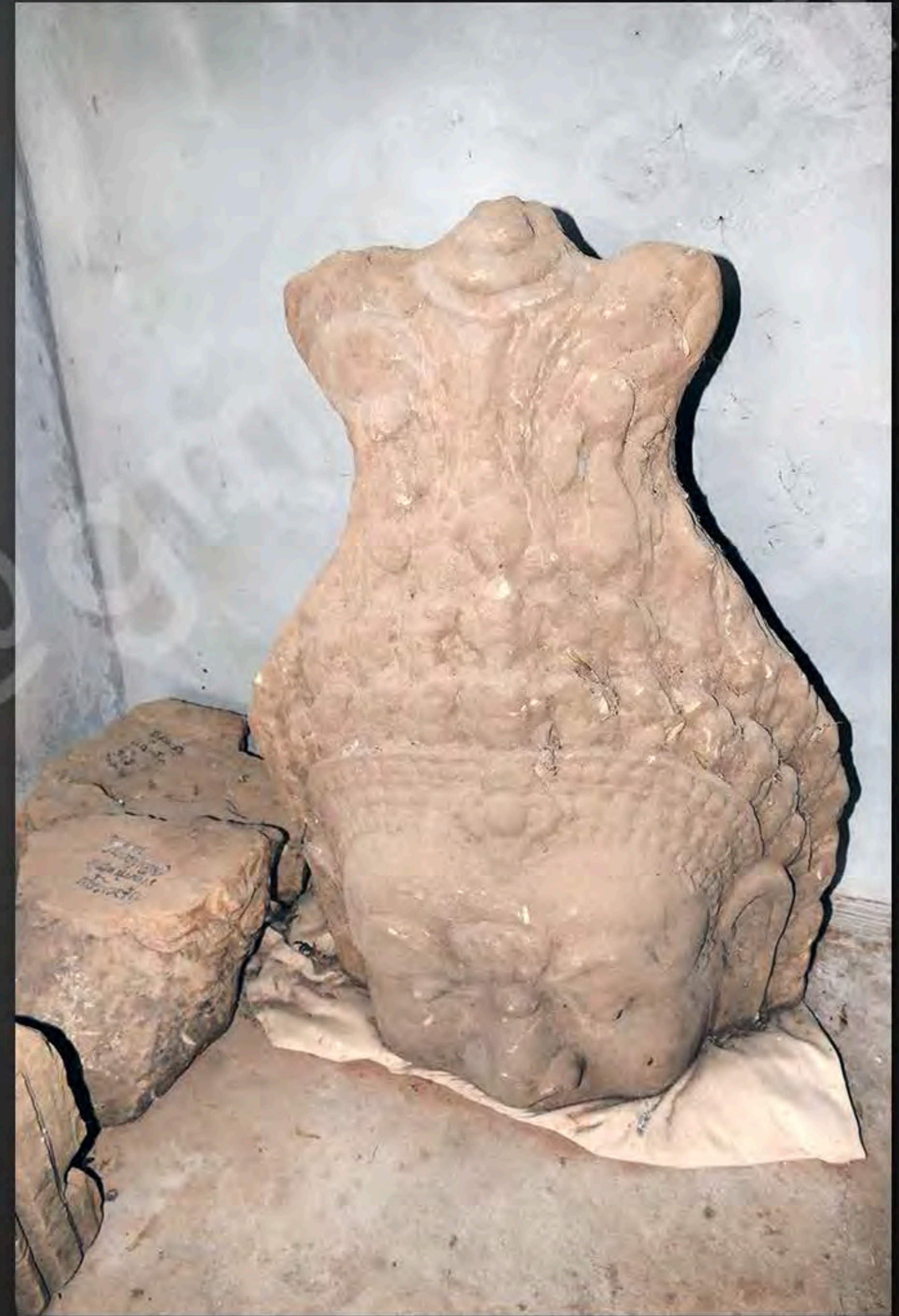
Heads of giants from the causway of the East gate of the domain enclosure (2015)