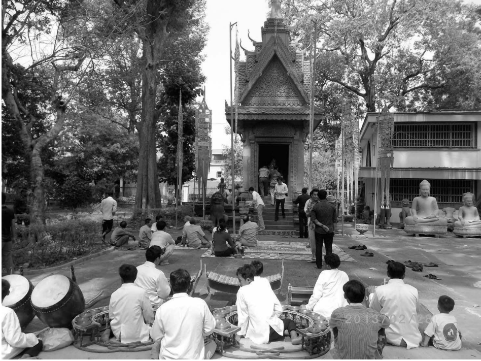
Fig. 2: Preah Kôk Thlok in the Angkor Conservation Office visited by Cambodian dignitaries (2013, Keiko Miura).

According to local informants and the staff member, the Khmer Rouge soldiers tried to destroy it with explosives made of landmines during the Pol Pot regime, but without success, though most other Buddha statues in Angkor Thom were damaged. This story of survival further enhanced the reputation of the potency of this Buddha statue. The present King Sihamoni also prayed to it. Since the gru 's identification of its potency, this Buddha has had a replica of the nāga covering attached to the back and was installed in an impressive shrine constructed especially for him (Fig. 2). Though there are many Buddha statues in the compound, this one receives the highest honours from dignitaries who visit to pray to it on special occasions. In fact, what can be seen at the vibear (temple hall) of Preah Kôk Thlok next to the Bayon temple today is a copy that also receives popular veneration.