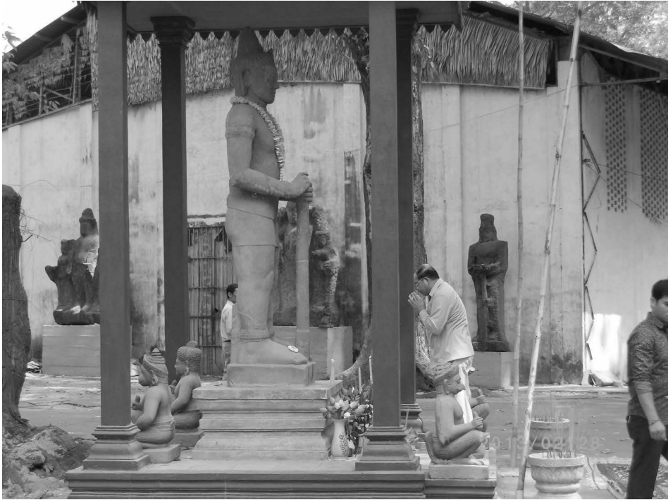
Fig. 3: The army general guarding Preah Vihear praying to original Tā Dâmbong Daek from Preah Khan (2013).

All the ancient temples have Dâmbong Daek statues guarding their gates, thus this neak tā is fairly popular, and many local mediums can be possessed by it during healing rituals.