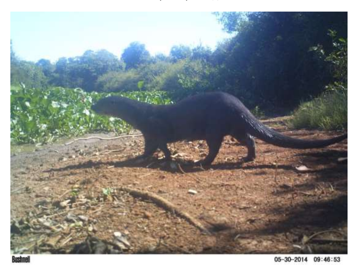
Figure 3. Hairy-nosed Otter Lutra sumatrana, Prek Toal, May 2014.