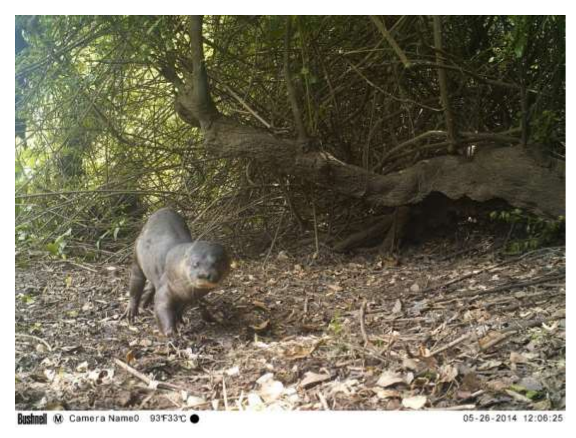
Figure 4. Hairy-nosed Otter Lutra sumatrana , Prek Toal, May 2014.