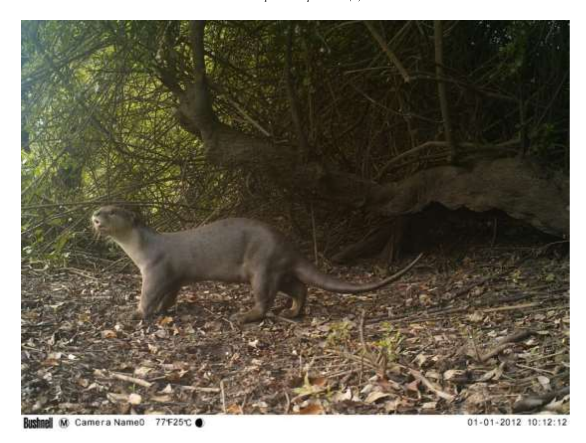
Figure 1. Smooth-coated Otter Lutrogale perspicillata, Prek Toal, May 2014.