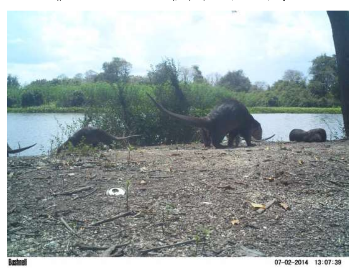
Figure 2. Group of five Smooth-coated Otters Lutrogale perspicillata , Prek Toal, July 2014.